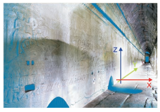
3D point cloud superimposed with color-mapped image

superimposed over these coordinates to create a true-to-life model.