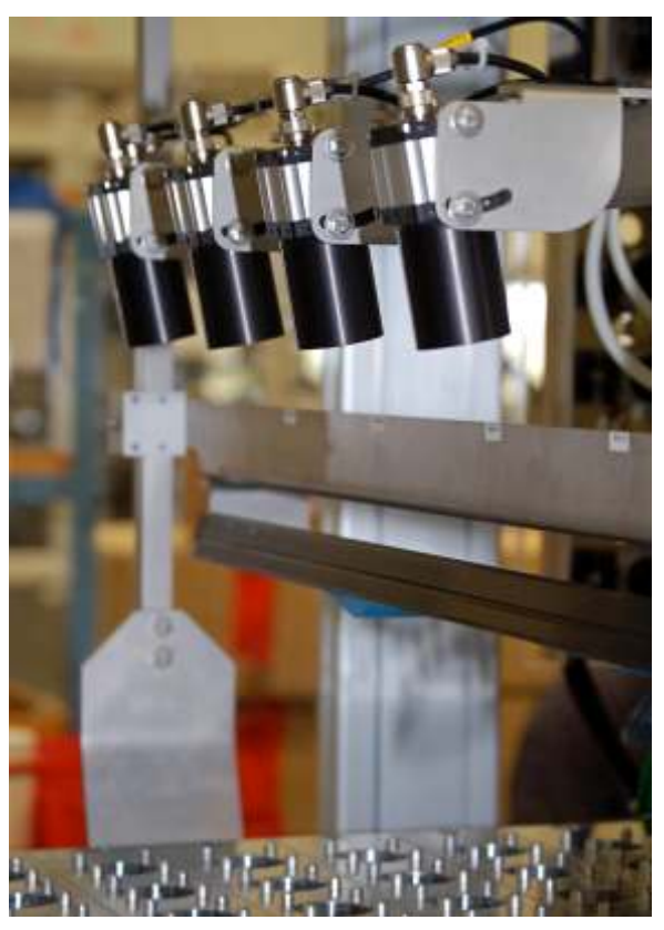
"A close eye on quality: Six cameras monitor the filling process"

The system is supplied as a complete solution including filling and inspection unit, and increases both production output and quality. Particularly for a major internationally renowned coffee producer, the system has to be perfect in every detail.